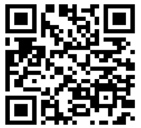
Dallas Mission Trip